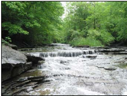
A photo of Brushy Creek in the Stonelick sub-watershed

Watershed Action Plans can be viewed and downloaded at http://www.clermontswcd.org