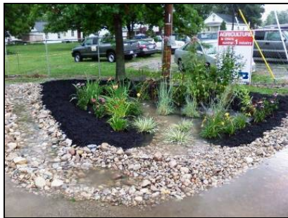
A rain garden planted outside the Clermont Soil and Water Conservation District offices in Owensville

For more information, or to learn more about how you can create your own rain garden, contact the Clermont SWCD at (513) 732-7075.