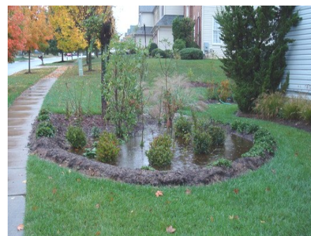
Rain garden capturing sidewalk runoff