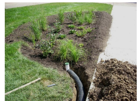
Installing underdrain with standpipe overflow