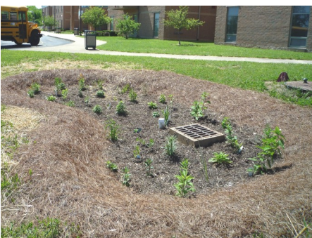
Using catch basin as garden overflow