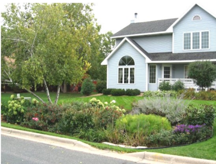
Curb cut capturing street runoff