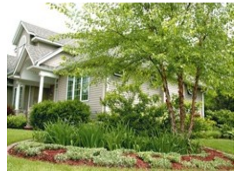
Trees, shrubs, flowers, groundcovers all work