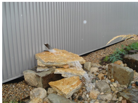
Downspout waterfall flowing to garden