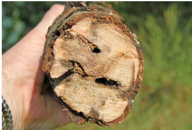
Larval tunnels or galleries can be found in broken branches of infested trees.