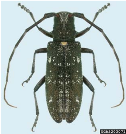
White-spotted sawyer.

Native cerambycid larvae are commonly found in dying or dead tree branches and trunks and are impossible to distinguish from ALB larvae. Roundheaded borers that are found in preferred ALB hosts such as maples should not be ignored, particularly if they are found in live trunks and branches; however, they should be identified by ALB experts.