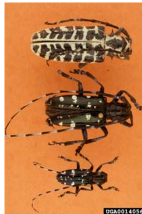
Cottonwood borer (top) with Asian longhorn beetle female (middle) and male (bottom). Female ALB are larger than males.

There are several insects native to the eastern U.S. that could be mistaken for ALB. Potential look-alikes include the cottonwood borer, the white-spotted sawyer and the eyed click beetle. The cottonwood borer and white-spotted sawyer are similar in size to ALB, but can be distinguished by solid black antennae (not banded) and different markings on the wings. The cottonwood borer has blocky white markings on the wings, while the white-spotted sawyer has mottled bronzy-black wings with white patches. The cottonwood borer and white-spotted sawyer larvae infest weakened and dying trees, and rarely affect healthy trees. The cottonwood borer infests the lower trunk and roots of poplar trees ( Populus spp.), with eastern cottonwood being the most preferred. The white-spotted sawyer infests pine tree species, including pines ( Pinus spp.), spruce