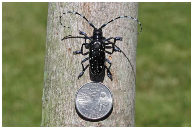
Asian longhorned beetle.

Adults emerge in late spring through late summer with peak emergence typically occurring in late June to early August; however, adults can be present in the fall. As adults chew their way out of the tree, they create large circular exit holes. Mating begins 2 to 3 days after emergence. ALB can overwinter in the egg, larval or pupal stage, but adults do not survive the winter, dying after the first fall freeze. There is one generation per year.