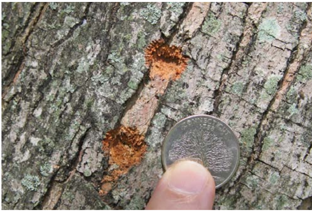
Oviposition pits in the bark where female beetles deposit an egg.