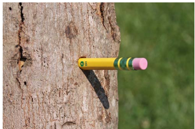
The pencil test. If a pencil can be inserted into an exit hole, it is a good indication that the hole was made by a cerambycid beetle because the larvae feed deep in the xylem.