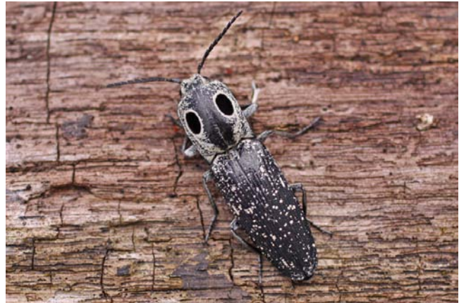
Eyed click beetle.