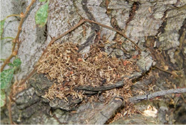
Sawdust present on the trunk, branches or base of the tree is a sign of adult or larval activity.