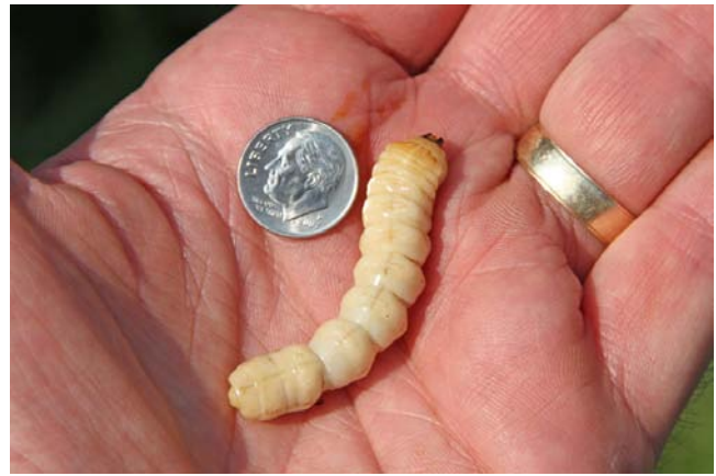
ALB larva.