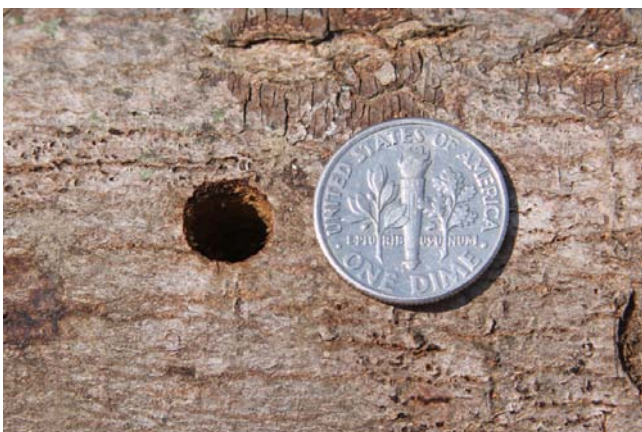
Emergence hole created by adult beetles.

Because the larvae feed primarily in the xylem, feeding damage decreases the structural integrity of branches, which become weak and break. Larval galleries are often apparent in broken branches. One outlying ALB population in Ohio was discovered because an alert homeowner became concerned when branches broke on a maple tree. As tree health declines, thinning of the canopy and dead branches become noticeable, but this only occurs after the tree has been infested for a number of years.