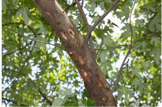
Woodpeckers create deep holes in the trunk and branches of infested trees as they excavate ALB larvae.