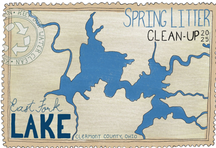
2025 Logo Contest Winner