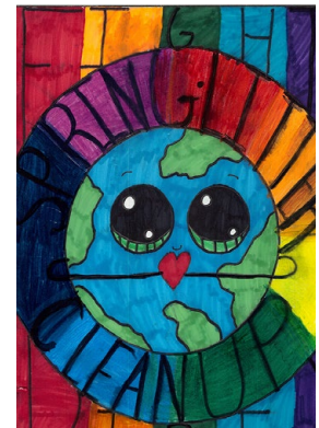
Previous Clean-up design submissions.