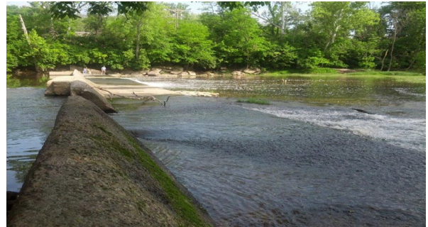
Batavia Dam prior to demolition.

This project also required the relocation of freshwater mussels within the project area. With the removal of Williamsburg Dam last year, this was the last remaining low-head dam on the main stem of the East Fork Little Miami River. This dam has not been in useful operation in many years and was beginning to deteriorate.