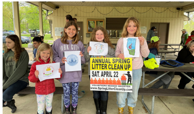
K-12 Spring Litter Clean Up logo design contest winners.