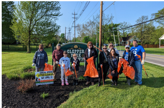
Volunteers that helped with 2023 Spring Litter Clean up at Clepper Park, Batavia, OH.