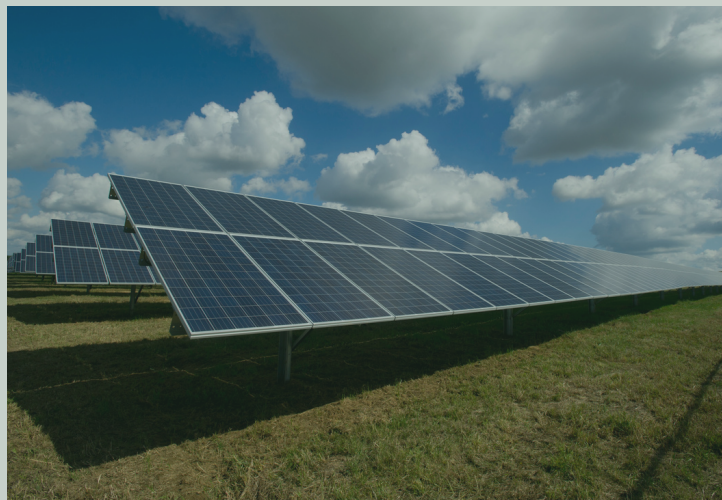
Image of Solar Panels from American Public Power Association

SWCD staff will continue to comment on any solar plans that are submitted for review, commenting on environmental, drainage, and overall layout concerns with the project. The District, in partnership with the Clermont Building Inspection Department, inspects erosion control and storm water management practices that are required under Clermont County's Water Management and Sediment Control (WMSC) regulations. Staff are also available to discuss site specific concerns in regards to solar installation with individual property owners.